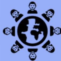
Community and Culture