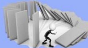
Cause and consequence