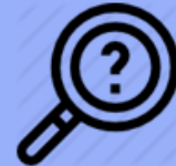
Enquiry and evidence