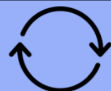
Continuity and change